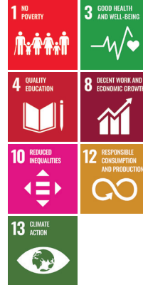
Günter Meier on an assignment at an inclusively working organisation in Honduras. He contributed to the implementation of 7 SDGs.