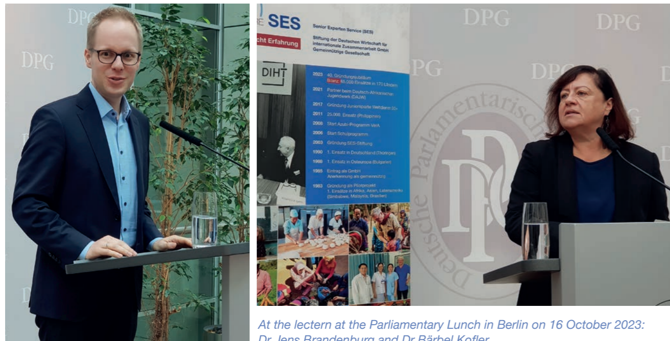
At the lectern at the Parliamentary Lunch in Berlin on 16 October 2023: Dr Jens Brandenburg and Dr Bärbel Kofler