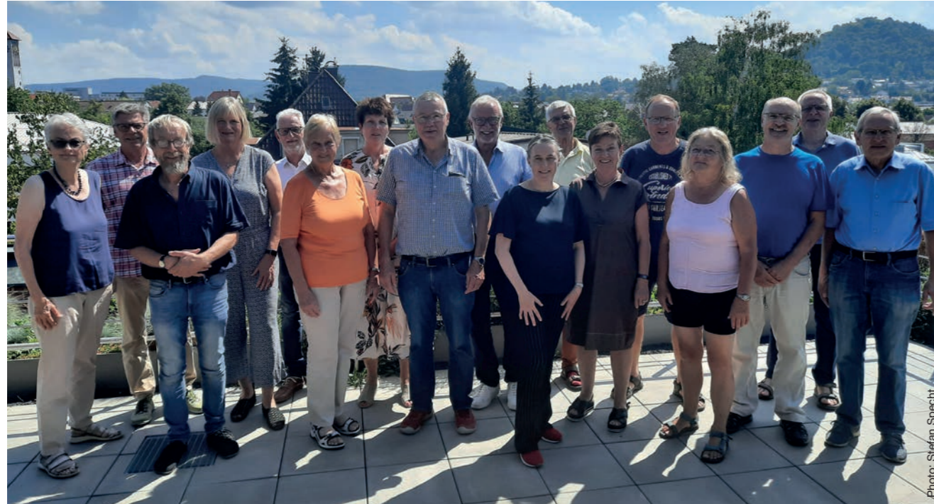
VerAplus: the participants in the exchange of experience at the Reutlingen Chamber of Crafts on 21 August 2023